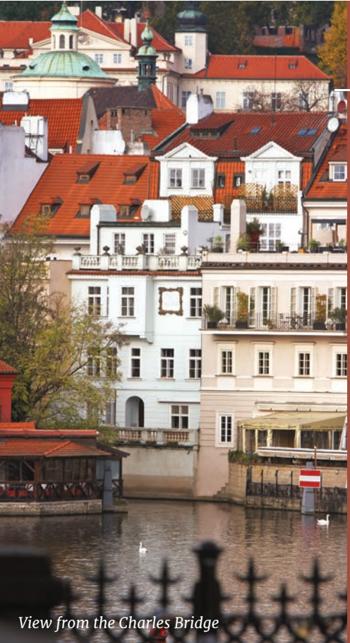
View from the Charles Bridge

Standing on parapets on both sides. There 30 of them altogether, plus one statue standing aside on a pillar at Kampa Island. Most of the statues are from 1706 – 1714.